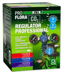
JBL PROFLORA CO2 REGULATOR PROFESSIONAL Pressure regulator with 2 displays & valve for CO2