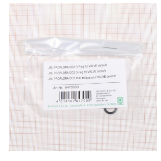
JBL PF CO2 O-ring for VALVE