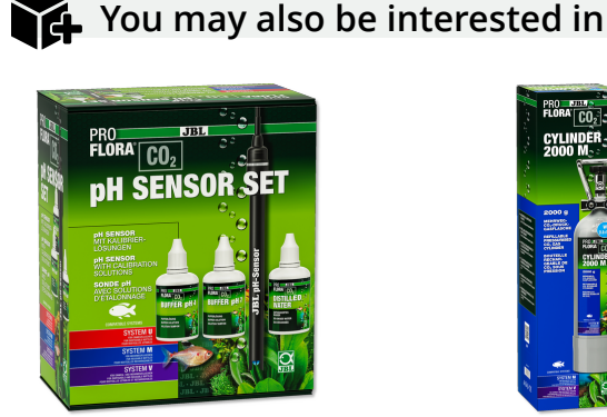
JBL PROFLORA CO2 pH SENSOR SET pH electrode, labor. guality for almost all pH devices