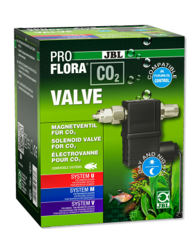
JBL PROFLORA CO2 VALVE CO2 solenoid valve for regulated CO2 addition