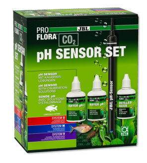
JBL PROFLORA CO2 pH SENSOR SET pH electrode, labor. quality for almost all pH devices