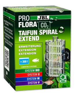
JBL PROFLORA CO2 TAIFUN SPIRAL EXTEND Extension for JBL PROFLORA CO2 TAIFUN SPIRAL 5 / 10