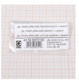
JBL PF CO2 flat gasket for u