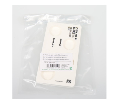
JBL PF CO2 CALIBRATION tray To keep the cuvettes upright during calibration