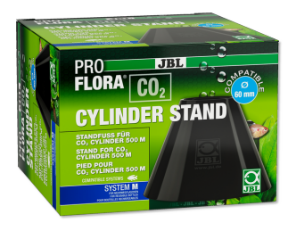
JBL PROFLORA CO2 CYLINDER STAND Stand for 500 g CO2 cylinders