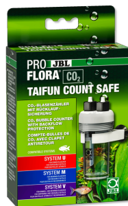
JBL PROFLORA CO2 TAIFUN COUNT SAFE CO2 bubble counter with built-in check valve