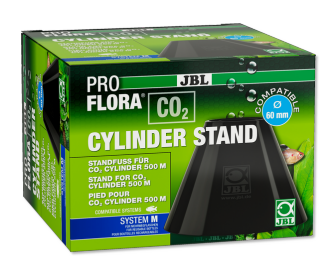
JBL PROFLORA CO2 CYLINDER STAND

Disposable storage bottle ready-filled with 1.2 kg CO2