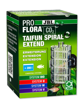
JBL PROFLORA CO2 TAIFUN SPIRAL EXTEND

Expandable CO2 reactor for freshwater aquariums