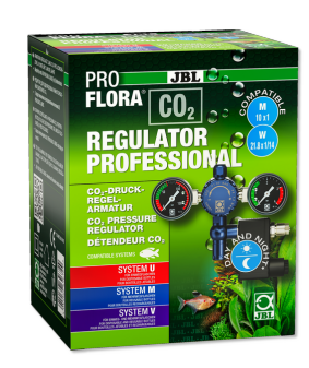
JBL PROFLORA CO2 REGULATOR PROFESSIONAL

Glass CO2 diffuser for freshwater tanks from 40-300 l