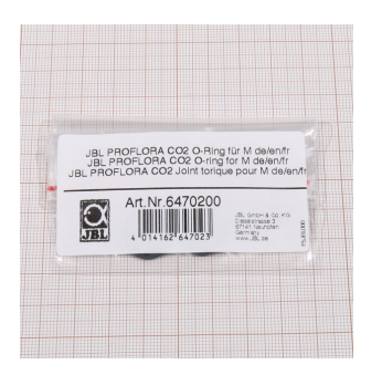
JBL PROFLORA CO2 Oring for m