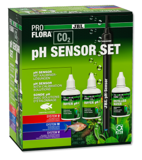
JBL PROFLORA CO2 pH SENSOR SET

pH electrode, labor. quality for almost all pH devices