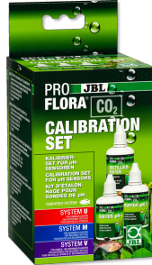
JBL PROFLORA CO2 CALIBRATION SET To calibrate and store pH electrodes