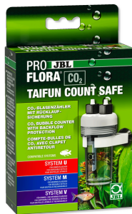
JBL PROFLORA CO2 TAIFUN COUNT SAFE CO2 bubble counter with built-in check valve