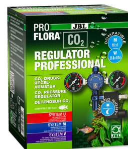
JBL PROFLORA CO2 REGULATOR PROFESSIONAL Pressure regulator with 2 displays & valve for CO2