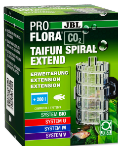
JBL PROFLORA CO2 TAIFUN SPIRAL EXTEND Extension for JBL PROFLORA CO2 TAIFUN SPIRAL 5 / 10