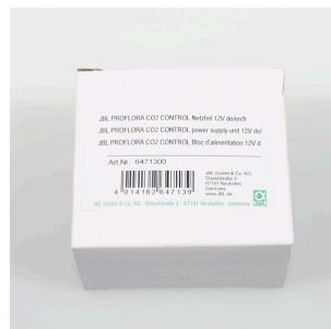
JBL PF CO2 CONTROL power supply unit 12V