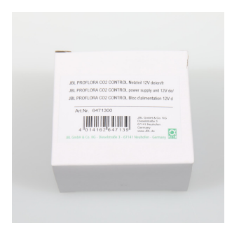
JBL PF CO2 CONTROL power supply unit 12V