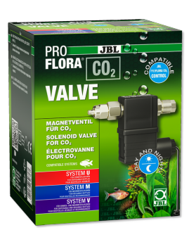
JBL PROFLORA CO2 VALVE

CO2 solenoid valve for regulated CO2 addition