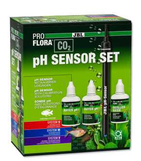
JBL PROFLORA CO2 pH SENSOR SET

pH electrode, labor. quality for almost all pH devices