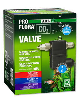
JBL PROFLORA CO2 VALVE

CO2 solenoid valve for regulated CO2 addition