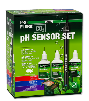
JBL PROFLORA CO2 pH SENSOR SET

pH electrode, labor. quality for almost all pH devices