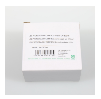
JBL PF CO2 CONTROL power supply unit 12V