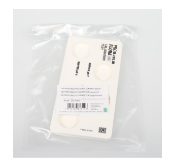
JBL PF CO2 CALIBRATION tray To keep the cuvettes upright during calibration