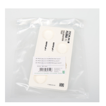
JBL PF CO2 CALIBRATION tray To keep the cuvettes upright during calibration