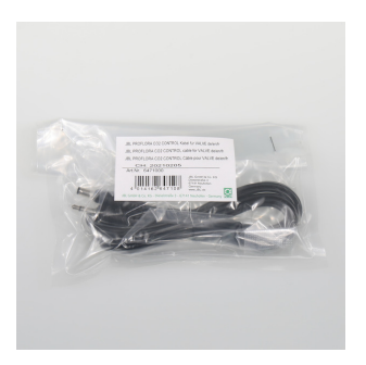
JBL PF CO2 CONTROL cable for VALVE