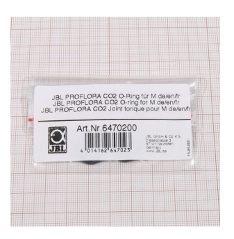
JBL PROFLORA CO2 Oring for m