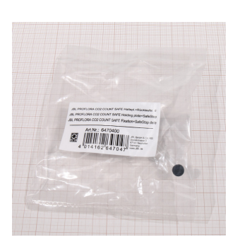
JBL PF CO2 COUNT SAFE mounting plate + backstop