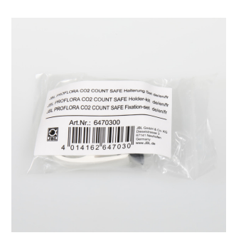
JBL PF CO2 COUNT SAFE holder set