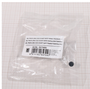
JBL PF CO2 COUNT SAFE mounting plate + backstop