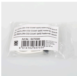
JBL PF CO2 COUNT SAFE holder set