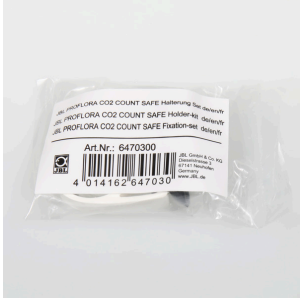
JBL PF CO2 COUNT SAFE holder set