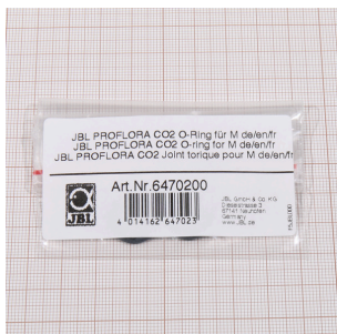
JBL PROFLORA CO2 O- ring for m