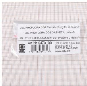
JBL PF CO2 flat gasket for u