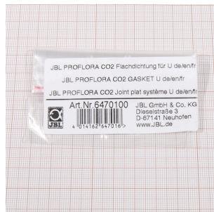
JBL PF CO2 flat gasket for u