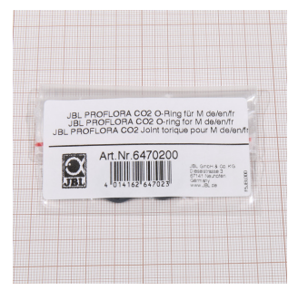
JBL PROFLORA CO2 Oring for m