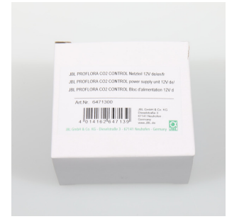
JBL PF CO2 CONTROL power supply unit 12V