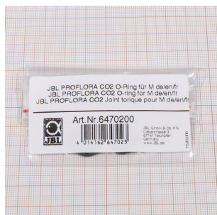
JBL PROFLORA CO2 O-ring for m