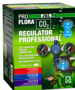
JBL PROFLORA CO2 REGULATOR PROFESSIONAL Pressure regulator with 2 displays & valve for CO2