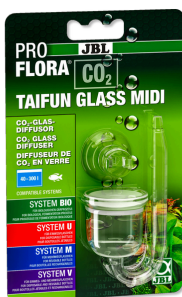
JBL PROFLORA CO2 TAIFUN GLASS Glass CO2 diffuser for freshwater tanks from 40-300 l