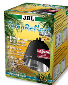
JBL TempReflect light Reflector screen for energy-saving lamps