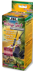
JBL TempSet angle+ connect Installation kit for lamps in terrariums