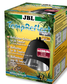
JBL TempReflect light Reflector screen for energy-saving lamps