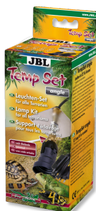
JBL TempSet angle Installation kit for lamps in terrariums