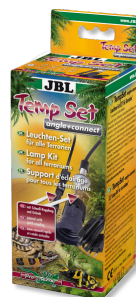
JBL TempSet angle+connect Installation kit for lamps in terrariums