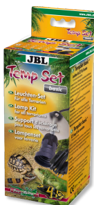
JBL TempSet basic Installation kit for lamps in terrariums