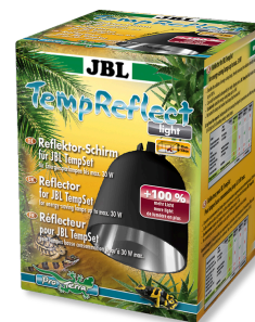
JBL TempReflect light Reflector screen for energy-saving lamps