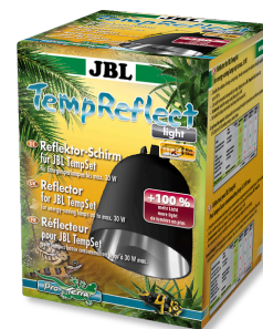
JBL TempReflect light Reflector screen for energy-saving lamps