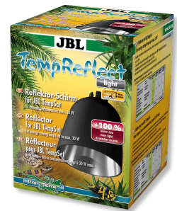
JBL TempReflect light Reflector screen for energy-saving lamps