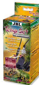
JBL TempSet angle+connect Installation kit for lamps in terrariums