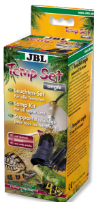
JBL TempSet angle Installation kit for lamps in terrariums