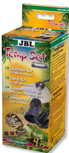
JBL TempSet basic Installation kit for lamps in terrariums