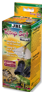
JBL TempSet angle Installation kit for lamps in terrariums