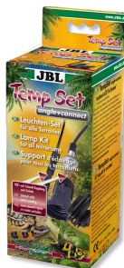
JBL TempSet angle+ connect Installation kit for lamps in terrariums