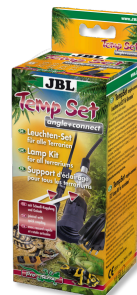
JBL TempSet angle+connect Installation kit for lamps in terrariums