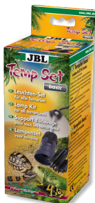
JBL TempSet basic Installation kit for lamps in terrariums