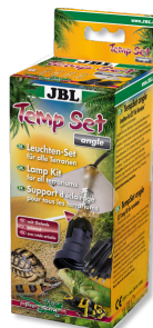
JBL TempSet angle Installation kit for lamps in terrariums