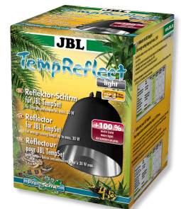
JBL TempReflect light Reflector screen for energy-saving lamps