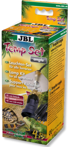
JBL TempSet angle Installation kit for lamps in terrariums