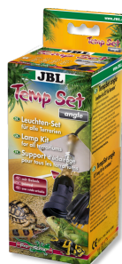
JBL TempSet angle Installation kit for lamps in terrariums