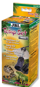
JBL TempSet basic Installation kit for lamps in terrariums