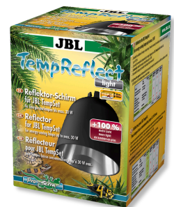
JBL TempReflect light Reflector screen for energy-saving lamps