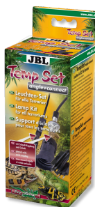
JBL TempSet angle+ connect Installation kit for lamps in terrariums