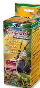
JBL TempSet angle+connect Installation kit for lamps in terrariums