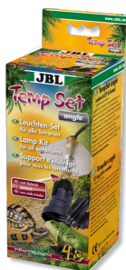
JBL TempSet angle Installation kit for lamps in terrariums