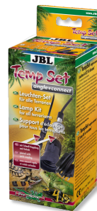
JBL TempSet angle+connect Installation kit for lamps in terrariums