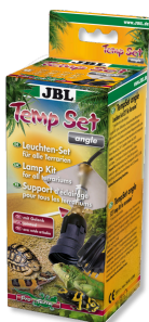
JBL TempSet angle Installation kit for lamps in terrariums