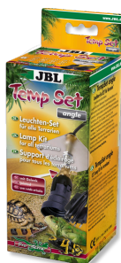
JBL TempSet angle Installation kit for lamps in terrariums