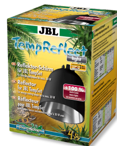
JBL TempReflect light Reflector screen for energy-saving lamps