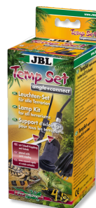
JBL TempSet angle+connect Installation kit for lamps in terrariums