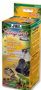
JBL TempSet basic Installation kit for lamps in terrariums