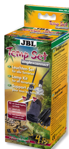
JBL TempSet angle+ connect Installation kit for lamps in terrariums