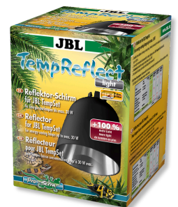
JBL TempReflect light Reflector screen for energy-saving lamps