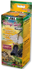
JBL TempSet angle Installation kit for lamps in terrariums