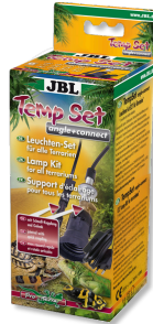
JBL TempSet angle+ connect Installation kit for lamps in terrariums