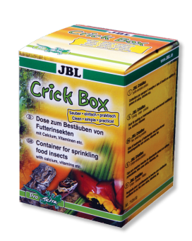
JBL CrickBox Shaker box to sprinkle powder on feeder insects